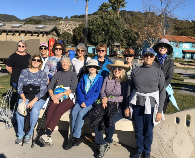
Hiking group enjoying another glorious central cost adventure!