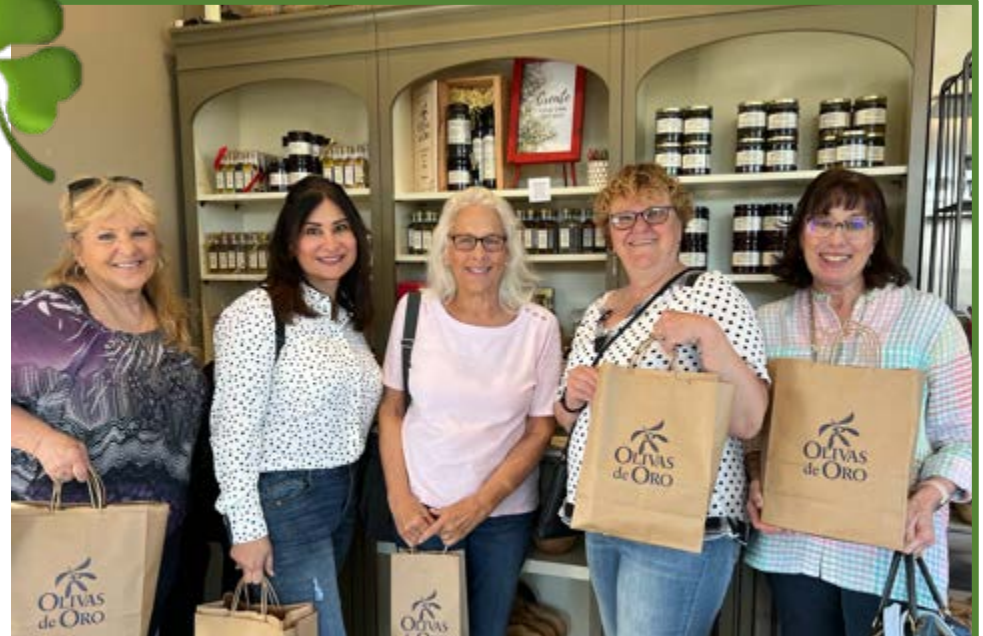
GG1 enjoyed Olive oil tasting at Tin City in Paso Robles, followed by lunch at McPhee's on 2/10.