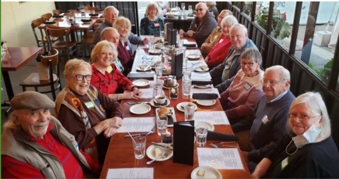
TGIF 1 enjoying an early Valentine's dinner at Gina's in AG on February 11 th .