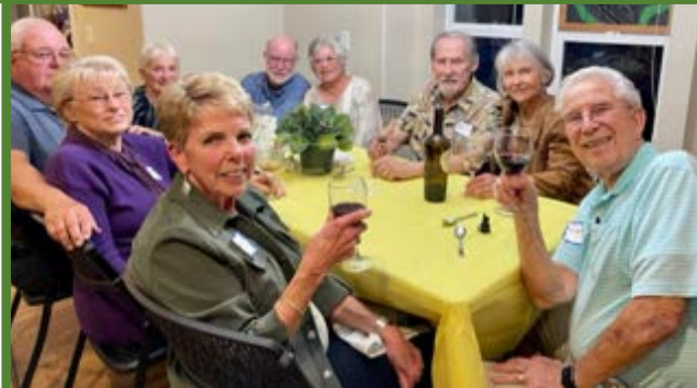
TGIF 2 met on March 25 to celebrate the first week of Spring! (several members are not pictured)