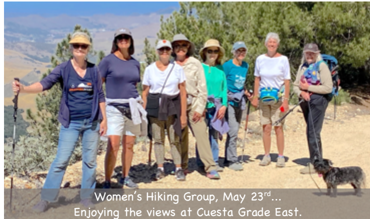
Women's Hiking Group, May 23 rd ... Enjoying the views at Cuesta Grade East.