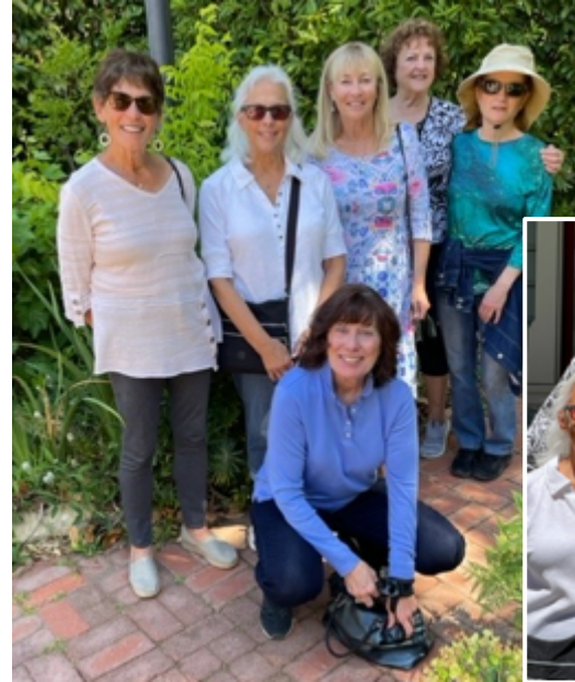
Ladies from GG1 enjoyed a garden tour of the Dallidet Adobe and a private tour of the restored Jack House Victorian in SLO on May 19 th .