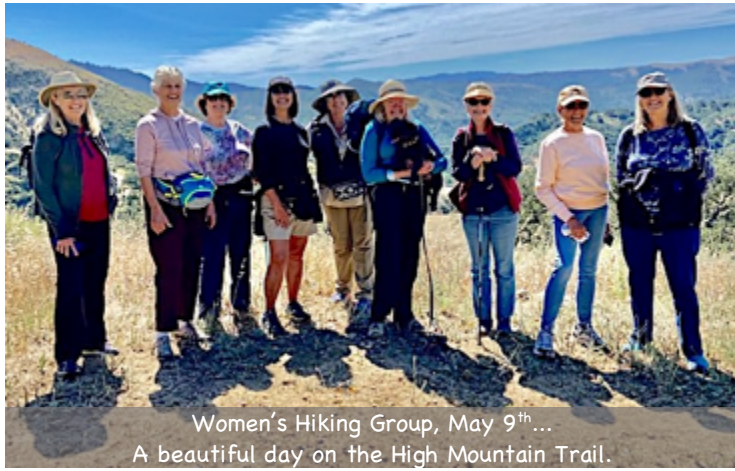
Women's Hiking Group, May 9 th ... A beautiful day on the High Mountain Trail.