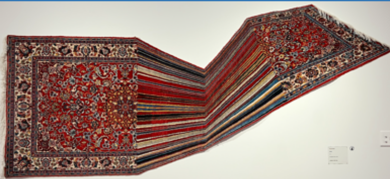
SLOMOA docent Sue Sacks led a tour of the intriguing art exhibit at the museum on May 12.

If you are interested in learning more about one of these activities - or another activity you think would be good - please see website and/or contact Pat Varonese. (contact info above)