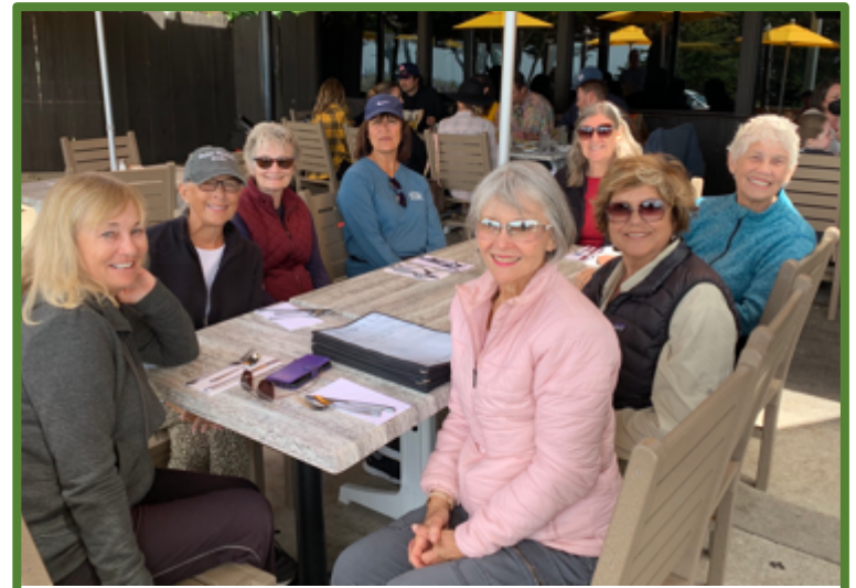
After a day viewing the elephant seals and a 4.5-mile bluffs hike, the hiking group enjoyed lunch at Moonstone Beach in Cambria on April 11<sup>th</sup>.