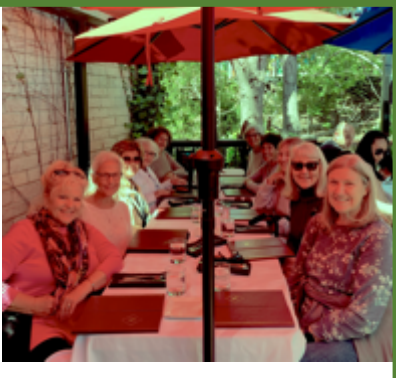
GG1 enjoyed a tour of the 'Garden of the Seven Sisters,' in SLO on April 14. Lunch followed at Nova.