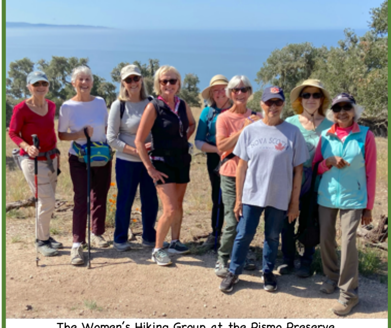
The Women's Hiking Group at the Pismo Preserve on April 25<sup>th</sup>. What a view!