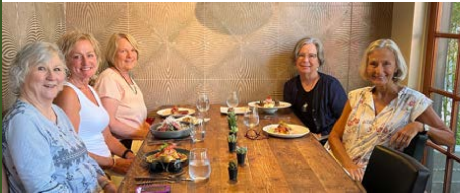
Lunch Bunch 2 at Mistura Peruvian restaurant in SLO (9/1/22)