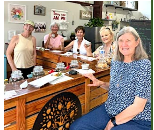
GG1 - Dewlson Family Farms 9/8/22 Fabulous hosts, fun and educational tour and tea tasting at Dewlson Family Farms near Santa Maria. 5 teas grown on site were served with goodies while learning about tea processing. We will be back!