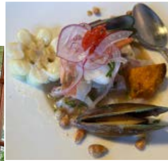
Mistura's delicious and very unique presentation...