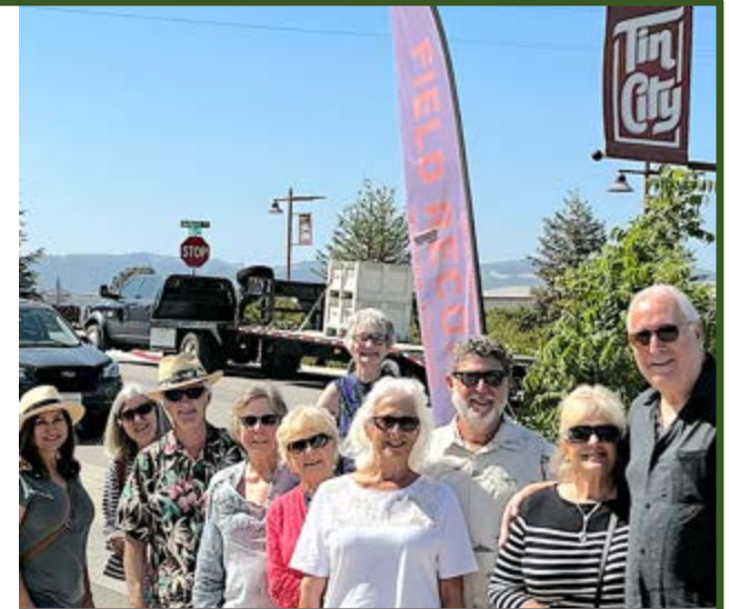
Great outing to Tin City in Paso Robles (9/15). This industrial marketplace showcases local craft wines, beer, and spirits.