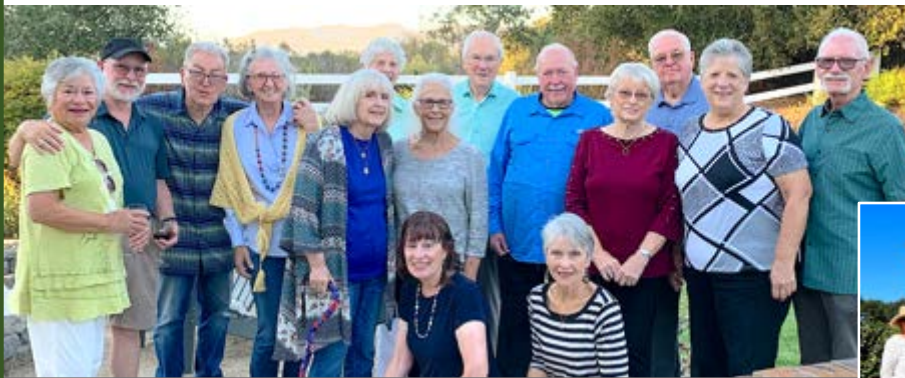
TGIF 2 met at the Pena's home on Friday, September 23.