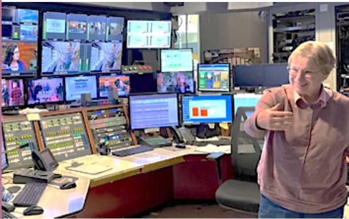
The Control room and the lady who puts it all together.