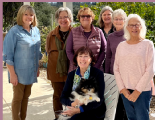
2023 Board (left to right)