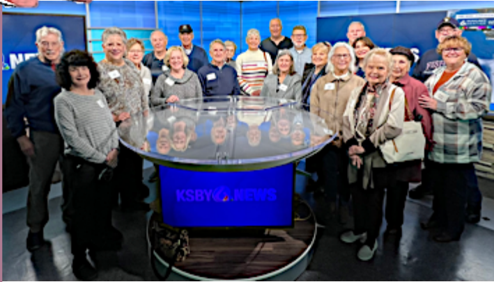
The 'morning group' gathered in the news room.