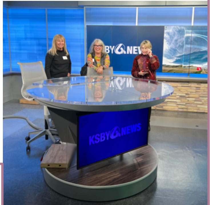
Three 'News-comers' with breaking news...

Thanks to all of you who joined or renewed before the first of the year. As of January 23 rd , 201 of you have signed on for 2023. The rosters will be handed out at the Raddison Brunch on 2/12.