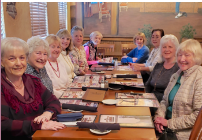
Lunch Bunch 1 enjoyed lunch at Cool Hand Luke's in Santa Maria. (1/25/23)