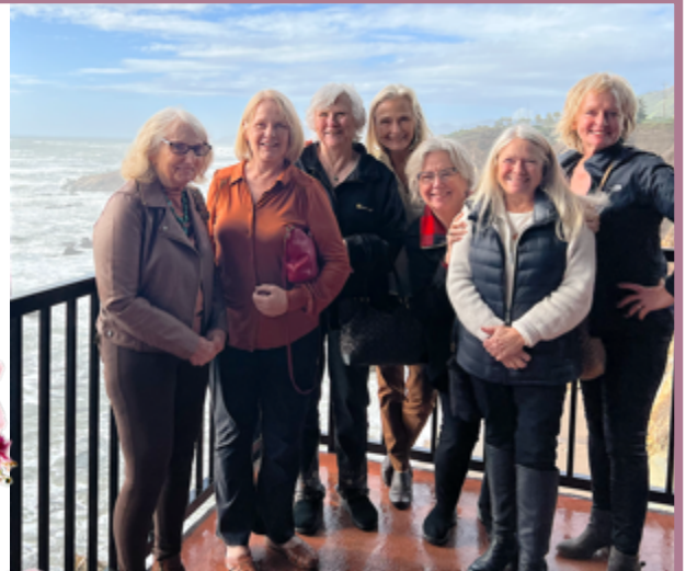
Lunch Bunch 2 after enjoying delicacies at the Ventana Grill on a rainy afternoon. (1/5/23)