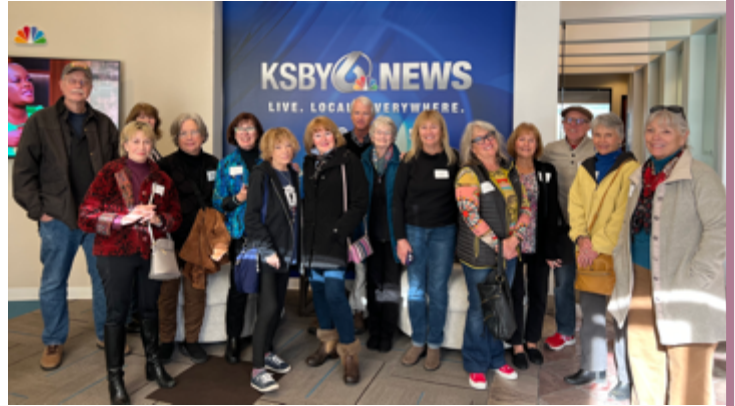
The 'afternoon group' gathered in the lobby.