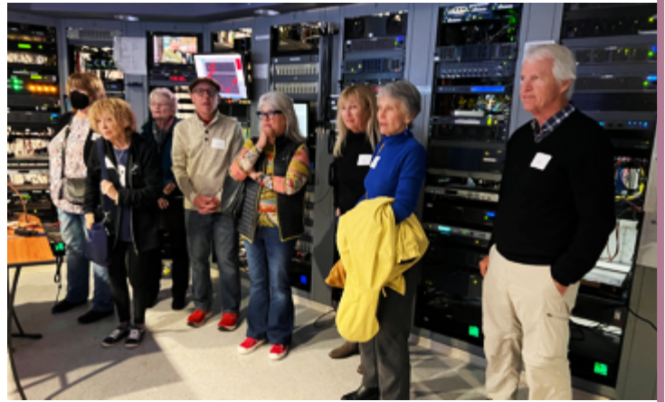
Watching magic happen in the Control room.