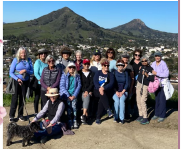
The Women's Hiking Group ventured to Terrace Hill in San Luis Obispo on a lovely, clear day. (1/23/23)