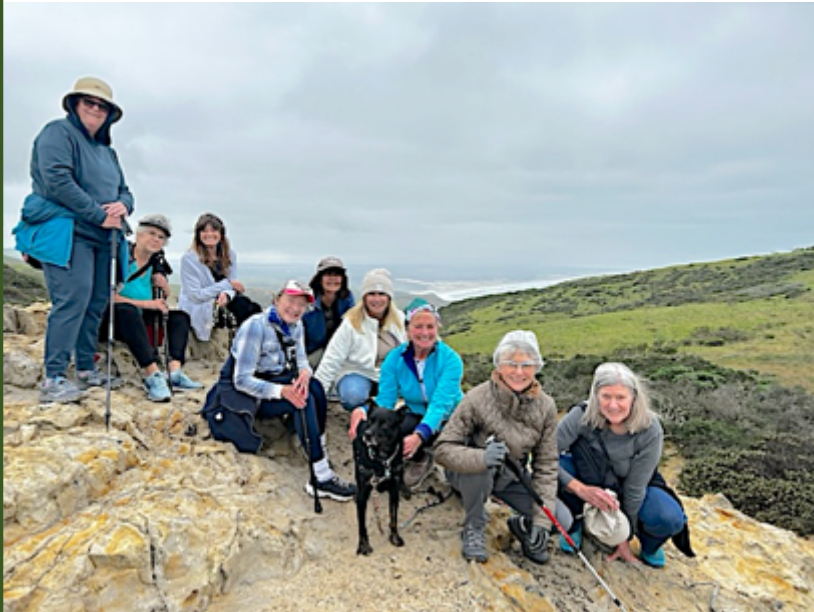
The Women's Hiking Group braved the weather on their trek to Point Sal. (above, 2/13/23)