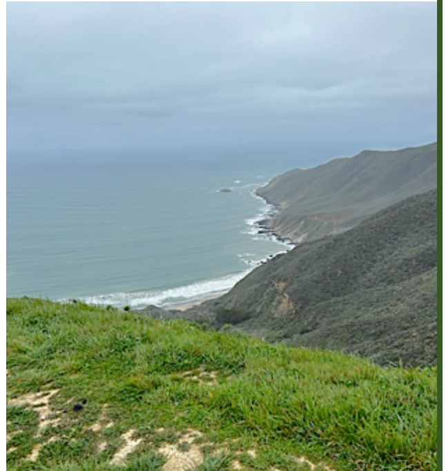
The view from the top! (top right)