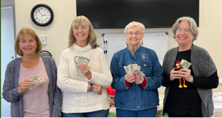
Congrats to the money-winners of Bunco 2! (2/13/23, above)