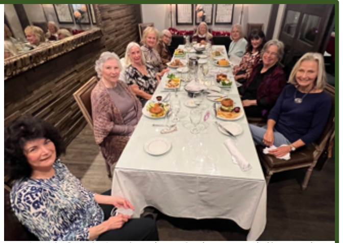
Lunch Bunch 2 enjoyed a private room at the Santa Maria Inn for another delicious lunch. (2/2/23, above)