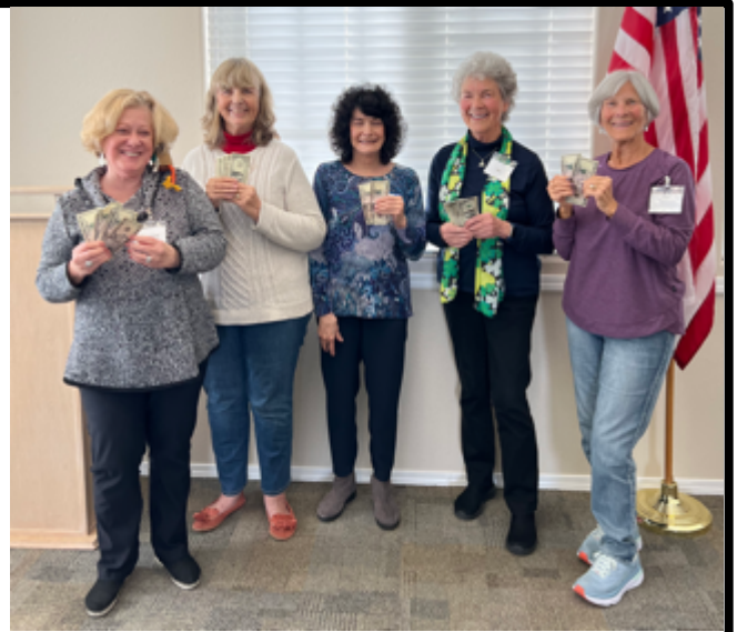
The Bunco 2 winners for March... (3/13/23, above)