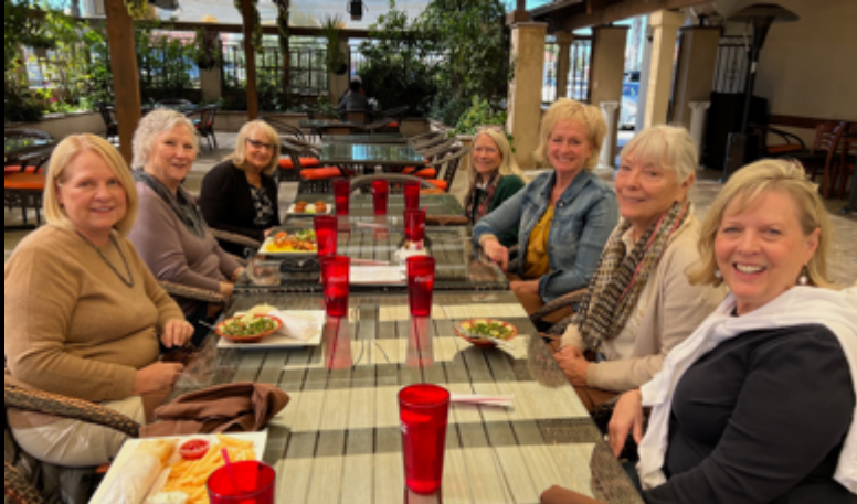
Lunch Bunch 2 met at the Mediterranean Garden in Santa Maria for an enjoyable outdoor lunch. (3/2/23, above)