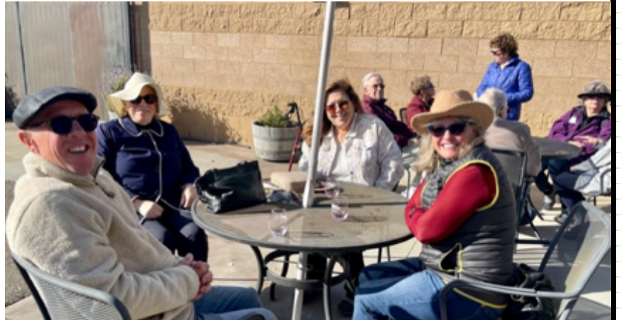
A number of Newcomers members and guests were treated to wine tasting and a tour of the facilities, off of College Ave. in Santa Maria. If you missed the Alan Hancock Wine Meet-up...