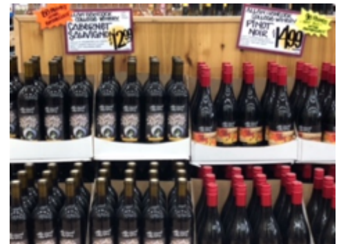
...you still have a chance to sample their wine, available at Trader Joe's in Santa Maria.