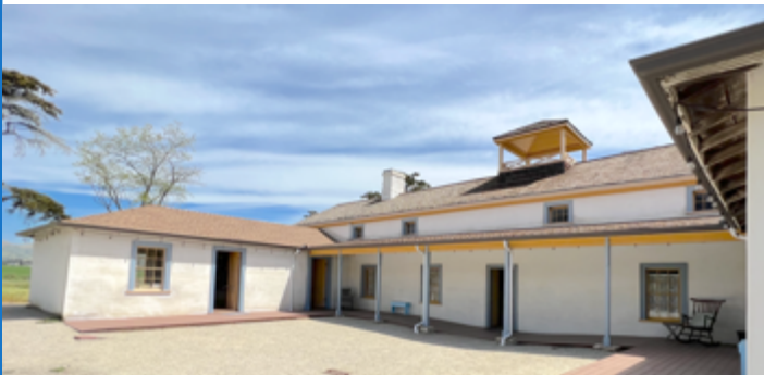
A group of Nipomo Newcomer history buffs toured the restored Dana Adobe and heard what life was like living here in the 1800s. After the tours, the group sat in the shade and enjoyed their sack lunches along with bottles of wine provided by the NNSC Board. A windy but fun day!