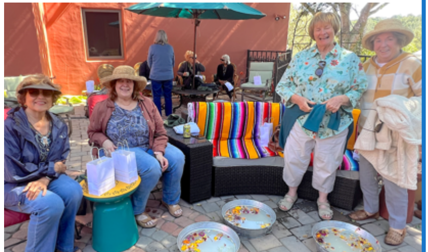
The GGs experienced a relaxing 'sip & spa' day at the beautiful Hacienda Felice in Arroyo Grande. (above, 4/13/23) We were treated to a guided tour of the gardens and vacation rooms prior to the spa experience. Art was everywhere!