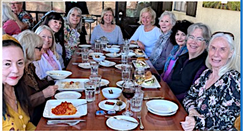
Lunch Bunch 2 enjoyed Gina's in the A.G. Village. (4/3/23, above)