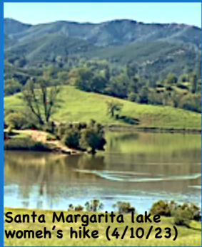
Santa Margarita Lake women's hike (4/10/23)

Check out our website: www.nipomonewcomers.com