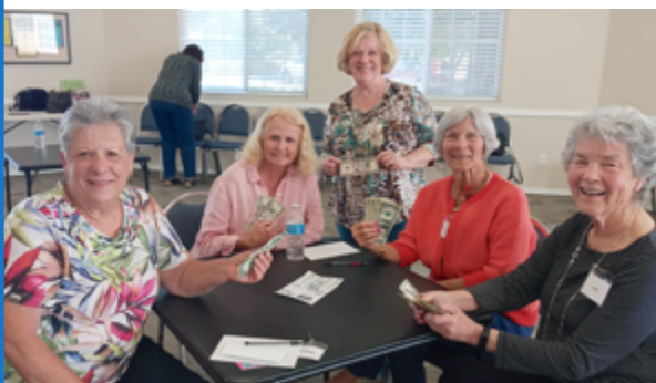
Bunco 2 - Happy winners! (4/10/23, above)