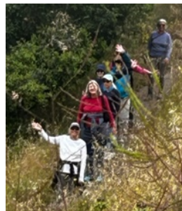
Women's Hiking Pismo Preserve (5/22/23) Right 2 photos