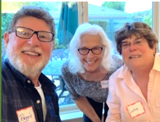
TGIF-2 (5/19/23) Left 3 photos