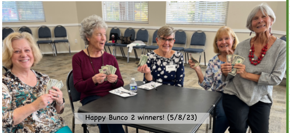
Happy Bunco 2 winners! (5/8/23)