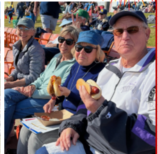
A sizable group of NNSC Blues Fans cheered the home town team on to victory! A spectacular Fireworks show completed the evening...