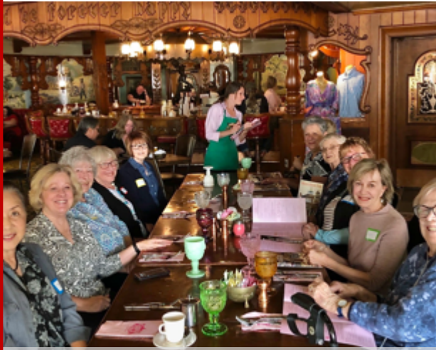
Lunch Bunch 1 at the Madonna Inn (6/1/23)