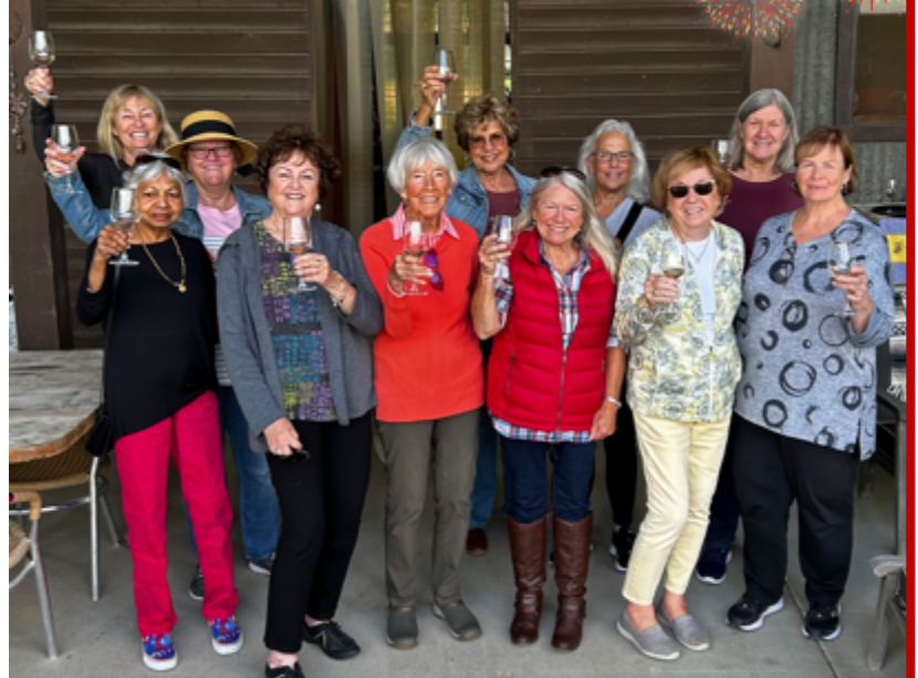
The GGs enjoyed wine and pizza at Sandoval Winery (6/8/23)