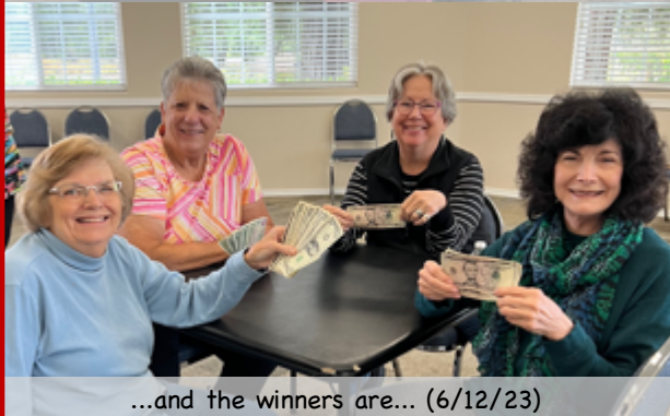
...and the winners are... (6/12/23)