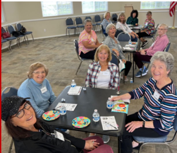
The Bunco 2 ladies take a break (6/12/23)