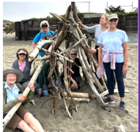
The Women hiked Morro Strand. (7/24/23)