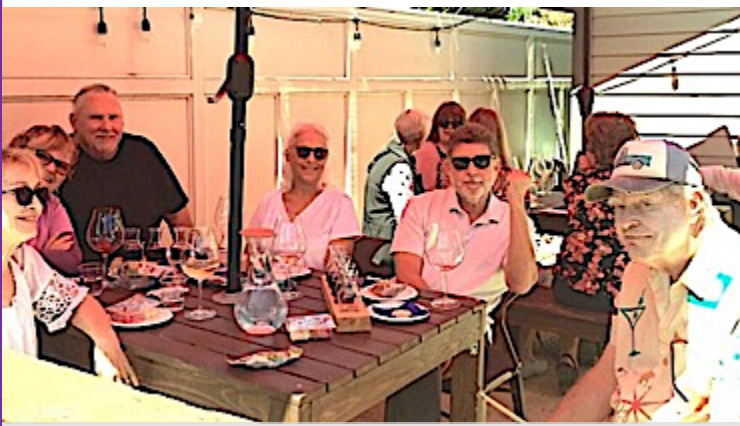
A relaxing afternoon for all...