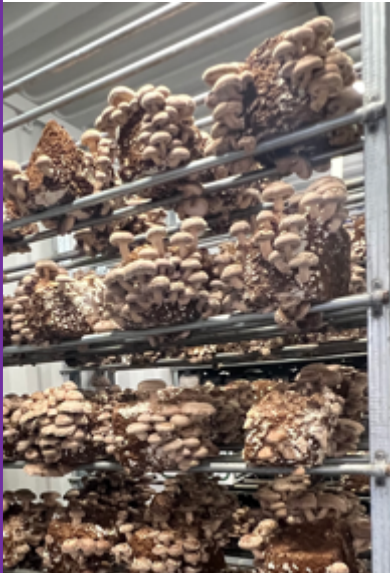
Racks of growing mushrooms...

Did you know that gourmet mushrooms are grown commercially in Paso Robles? Neither did the GGs, but boy, what an exceptional tour! Some of us bought kits so we could try growing mushrooms at home. Lunch afterwards was at Finca, where we could order mushroom tacos & burritos. Such a treat!