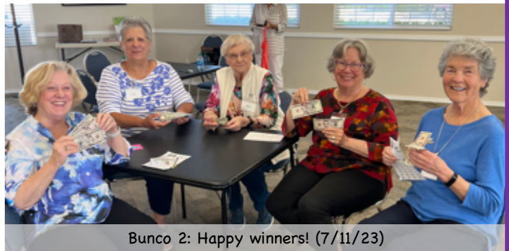
Bunco 2: Happy winners! (7/11/23)