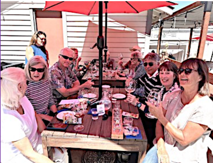
Good friends, beautiful weather, great wine!