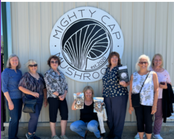
The GGs learned all about mushrooms. (7/13/23)