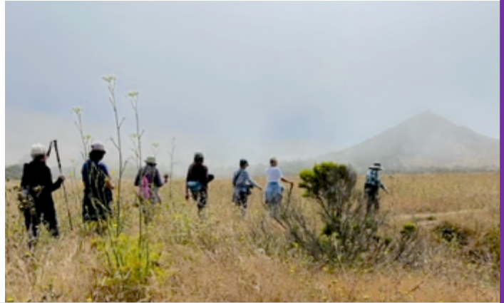
Women's Hiking at Estero Bluffs State Park, Cayucos. (7/10/23)