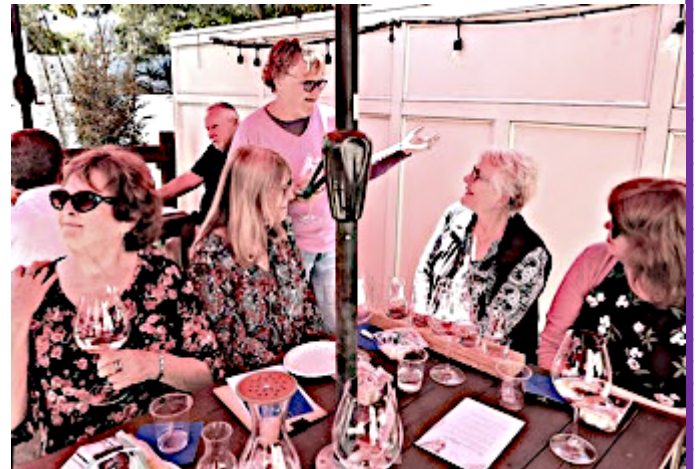
Welcome to new friends and old.