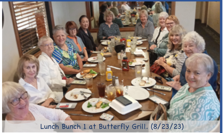
Lunch Bunch 1 at Butterfly Grill. (8/23/23)