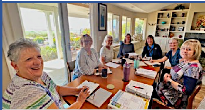
Your Board hard at work. (9/26/23)

Without a Board , a club can't operate. Help keep NNSC on track and consider donating a small portion of your time by serving on our Board next year. For more information, contact any current Board member.