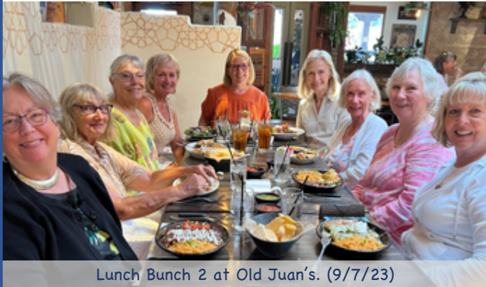
Lunch Bunch 2 at Old Juan's. (9/7/23)