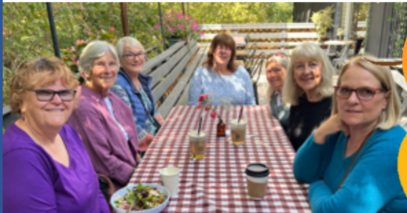
The GGs at Bubbles & Tea in Nipomo. (9/14/23)