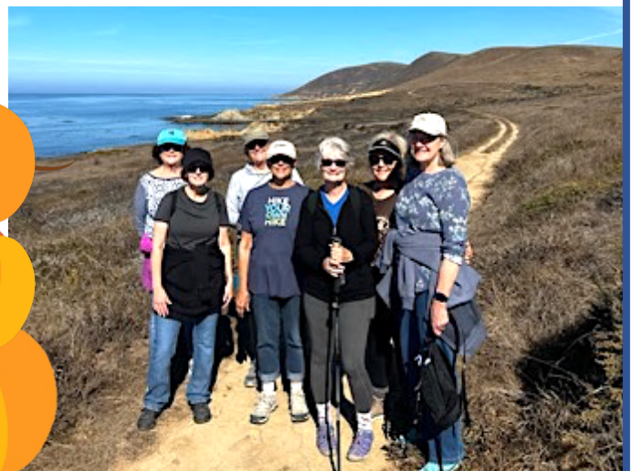
Women's Hikers enjoyed Harmony Headlands. (9/25/23)