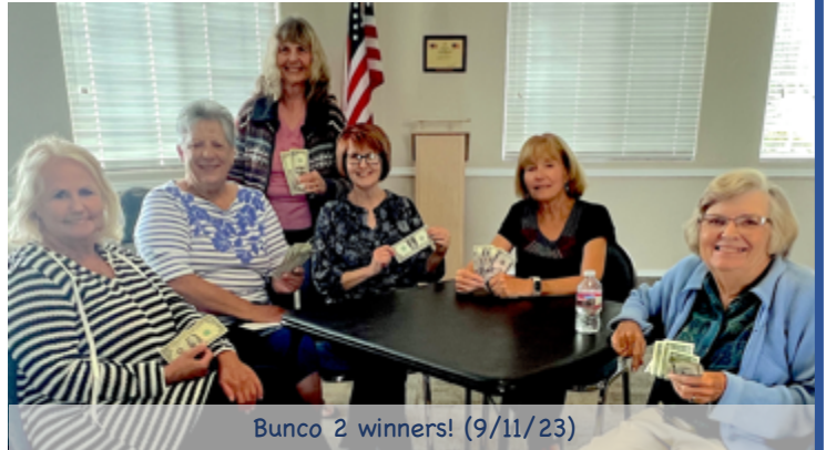
Bunco 2 winners! (9/11/23)