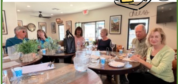
Wine tasting at Steller's Cellar in Orcutt. (10/19/23)