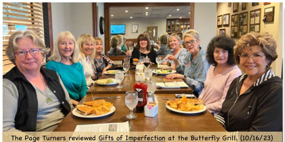
The Page Turners reviewed Gifts of Imperfection at the Butterfly Grill. (10/16/23)