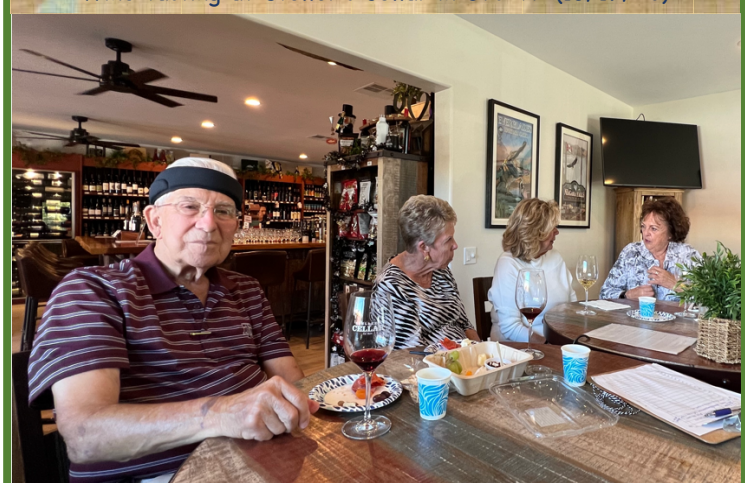
A delightful afternoon enjoying the wine & company. (10/19/23)