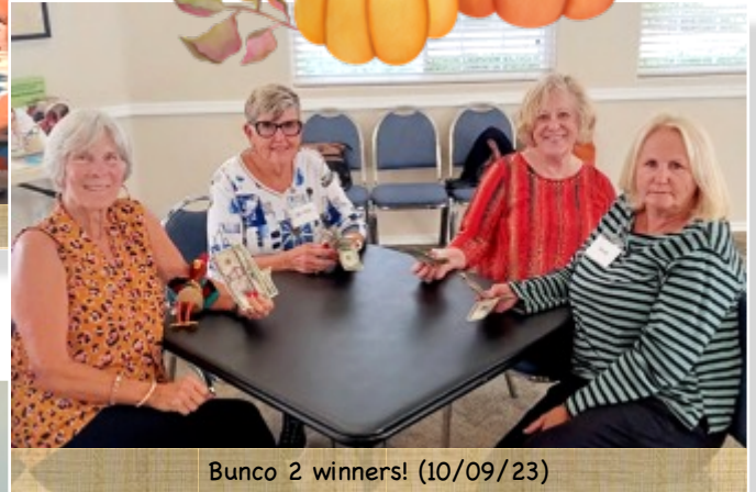
Bunco 2 winners! (10/09/23)