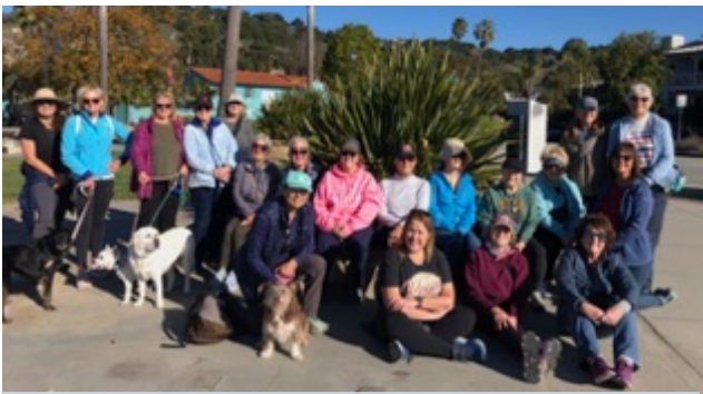
Five four-legged hikers and their 24 companions braved the Bob Jones Trail. (1/8/24)