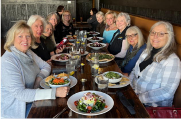
Lunch Bunch 2 enjoyed eating at Rooster Creek. (1/4/24)