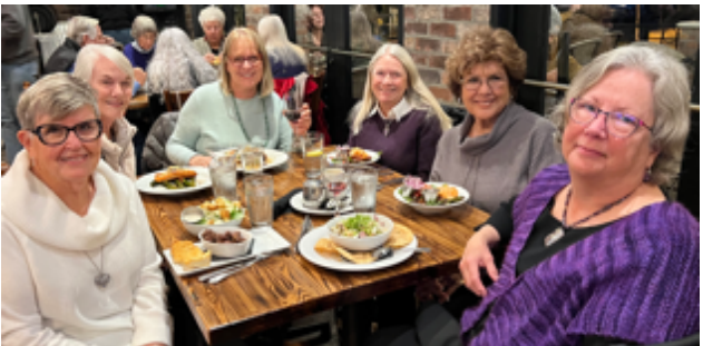
Some of the Theater Goers grabbed a bite at Rooster Creek prior to seeing Doo Wop at the Clark Center. (1/15/24)