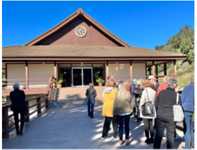
The GGs arrive at Avila's Buddhist Temple. (1/11/24)