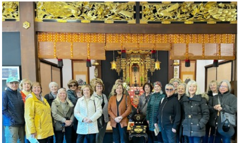
The GGs visited the Buddhist Temple & lunched at Blue Moon Over Avila. (1/11/24)