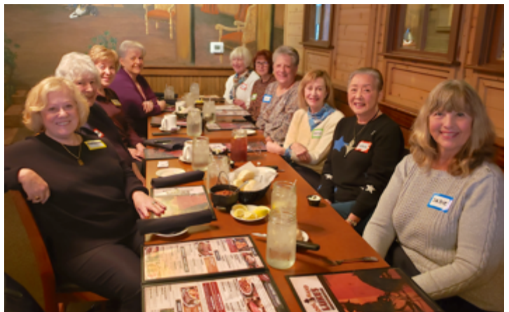
Lunch Bunch 1 enjoyed eating at Cool Hand Luke's in SM. (1/24/24)