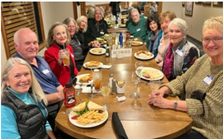
TGIF3 welcomes new members at the Butterfly Grill. (1/19/24)