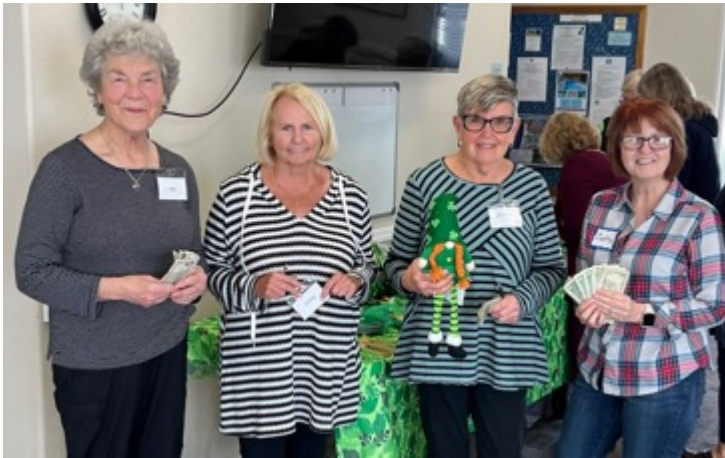
Happy Bunco 2 cash prize winners! (3/11/24)

What IS that thing? A cow holding binoculars, of course! The Women's Hiking Group also enjoyed the views from Cerro Alto Peak. (2/26/24)