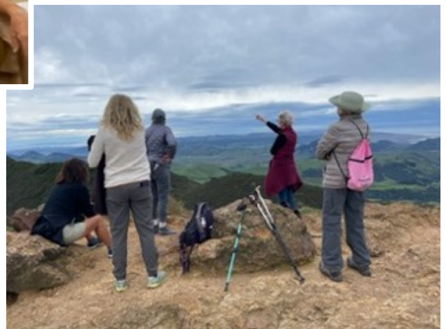
The Women's Hiking Group fearlessly hiked to the top of Islay Hill for even more beautiful views! (3/11/24)