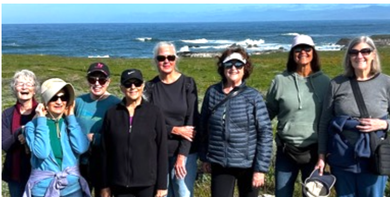
The Point Buchon Trail on PGE land near Los Osos was explored by the Women's Hiking Group on 3/25/24.