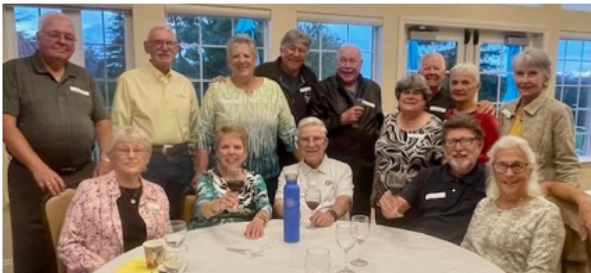
TGIF2 met together at the Pena home for a relaxing evening. (3/22/24)