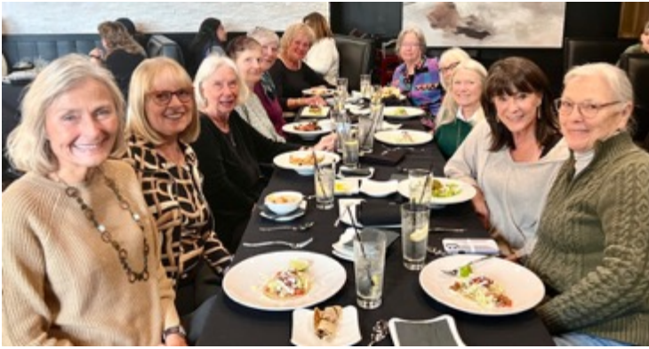
Lunch Bunch 2 tried out a variety of dishes from the new Beso Cocina in Nipomo. (3/7/24)