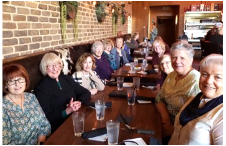
Lunch Bunch 1 met for good food and good friends at Mason Bar and Kitchen in Arroyo Grande. (2/28/24)