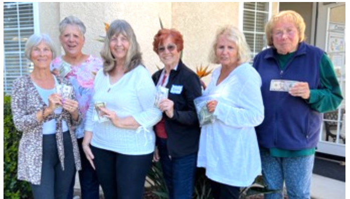
Bunco 2 winners. (4/8/24)