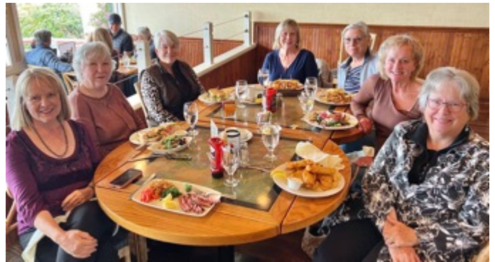
Lunch Bunch 2 enjoyed Spyglass in Shell Beach. (4/4/24)