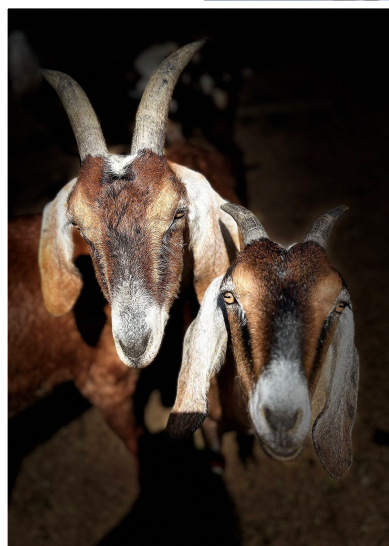
The GGs visited Black Market Cheese Co. north of Paso Robles to discover & taste. (4/18/24)