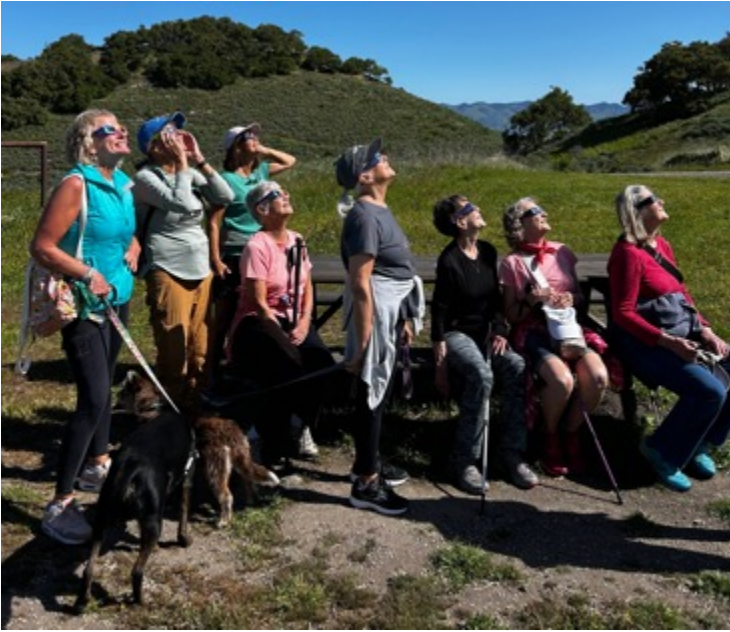
The Women's Hiking Group spotted the solar eclipse while hiking the Pismo Preserve. (4/8/24)