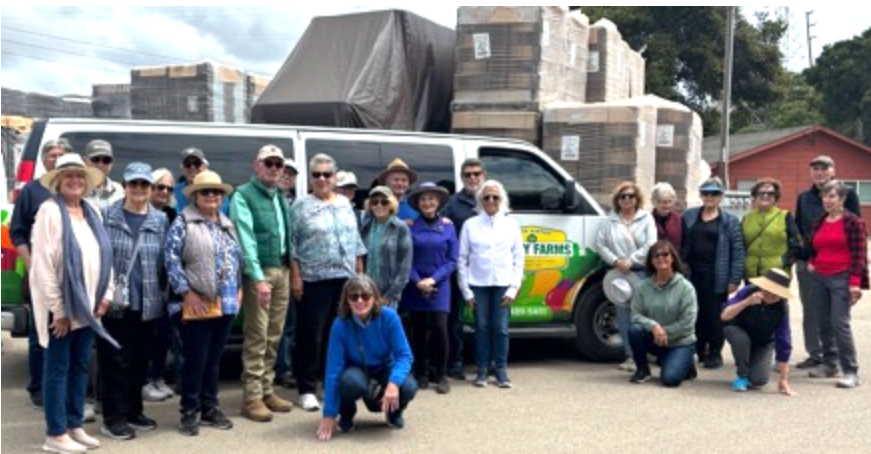
The Talley Farms tour was very informative and was enjoyed by all. (4/25/2024)