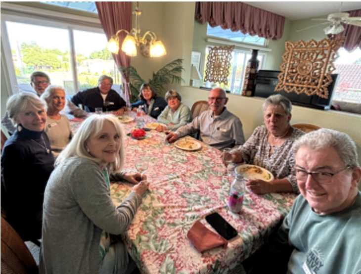
TGIF 2 enjoyed meeting at the Graham's home. (4/26/24)