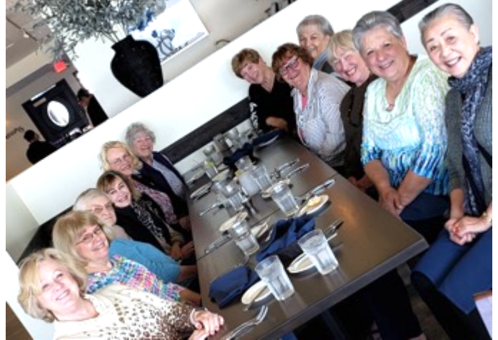
Lunch Bunch 1 lunched at Vista in Pismo Beach. (3/22/24)