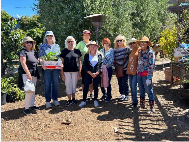
The Garden Group at the Garden of Weedon