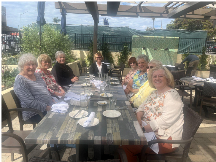
Lunch Bunch 1 at Ada's Fish House