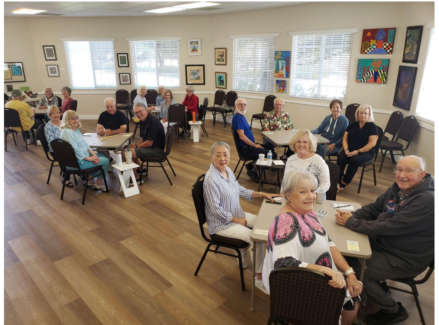
Friday Bridge group