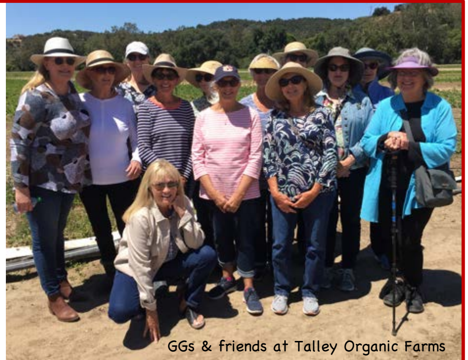
GGs & friends at Talley Organic Farms

July will take us to the Lavender fields of the Santa Ynez valley and on a self-guided tour of the gardens of Mission Inés.