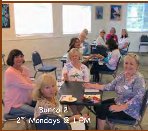
Bunco 2 2 nd Mondays @ 1 PM