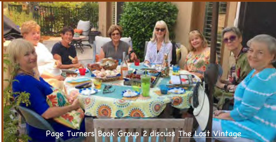
Page Turners Book Group 2 discuss The Lost Vintage