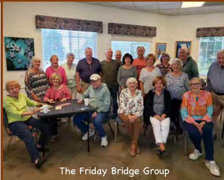
The Friday Bridge Group