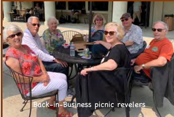
Back-in-Business picnic revelers