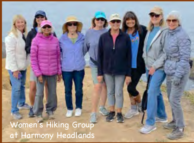
Women's Hiking Group at Harmony Headlands