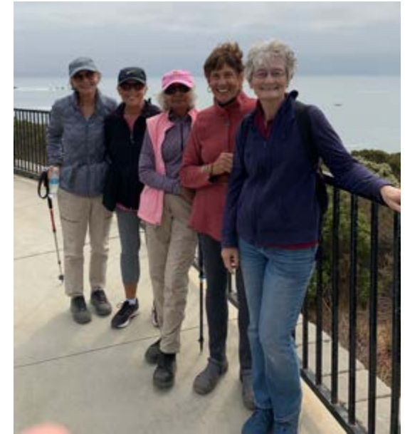
△ Women's Hiking Group