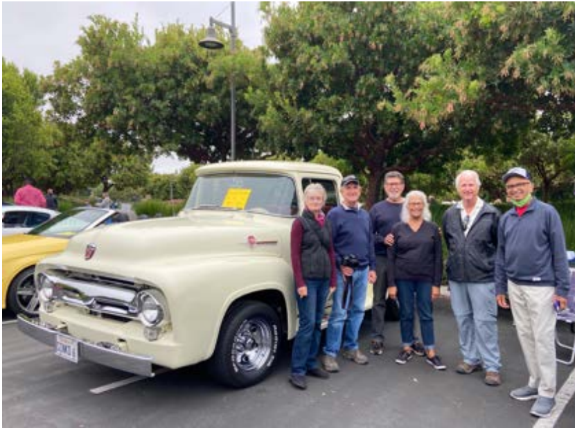
A few Nipomo friends enjoying the Trilogy car show together... △