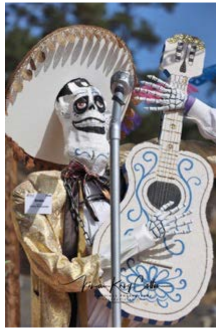
The GGs traveled to Cambria in October in to enjoy the Scarecrow Festival. △