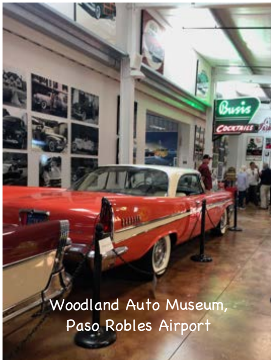
Woodland Auto Museum, Paso Robles Airport

Hiking group on a decent tour of Point San Luis Lighthouse in Avila.