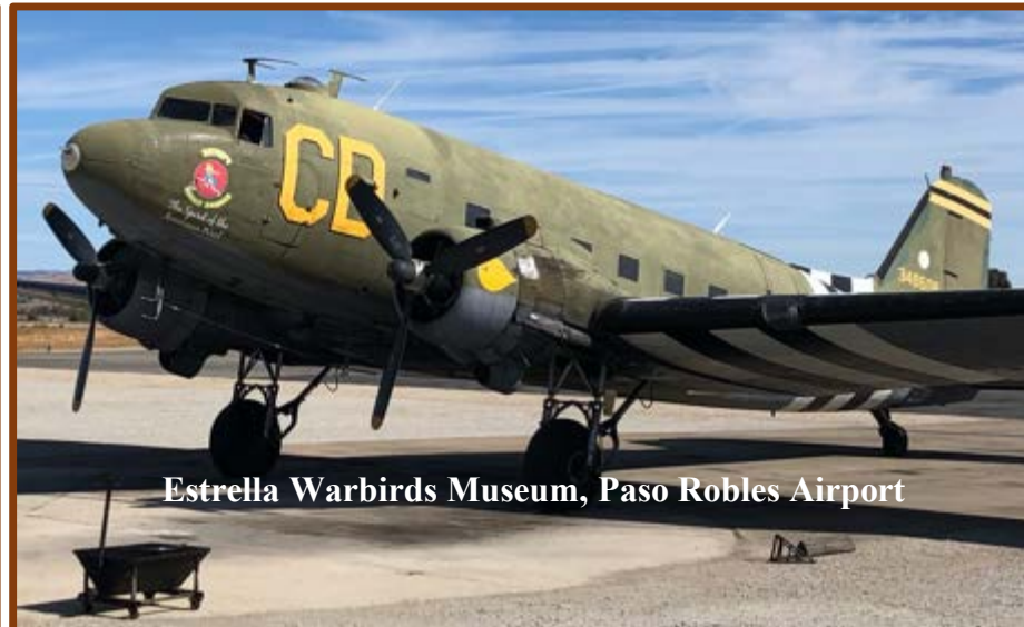
Estrella Warbirds Museum, Paso Robles Airport