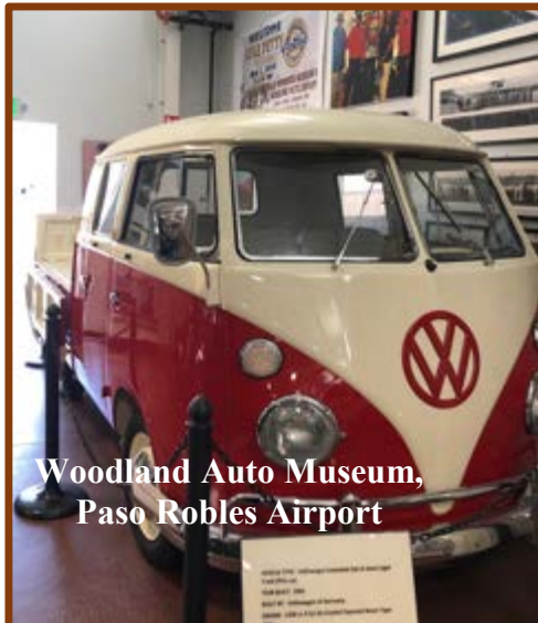
Woodland Auto Museum, Paso Robles Airport