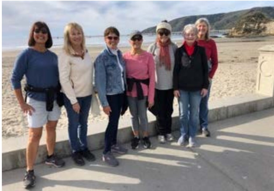
2022 got off to a good start on the Bob Jones Trail.