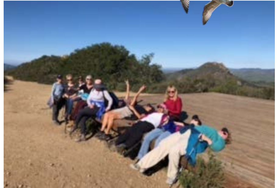
January 24 th - The Women's Hiking Group at Cerro San Luis.