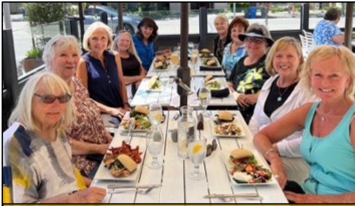
Lunch Bunch 2 had fun in the sun at Taste in SLO. (5/2/24)