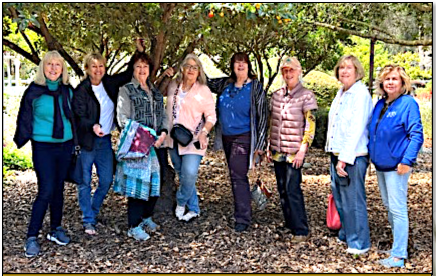
The GGs visited 4 members' gardens. All were delighted! (5/23/24)