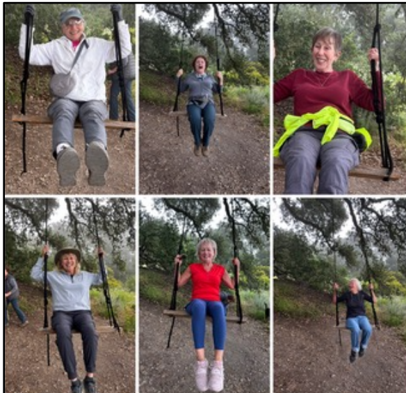
Women Hikers got into the swing of things at Sycamore Ridge. (5/13/24)