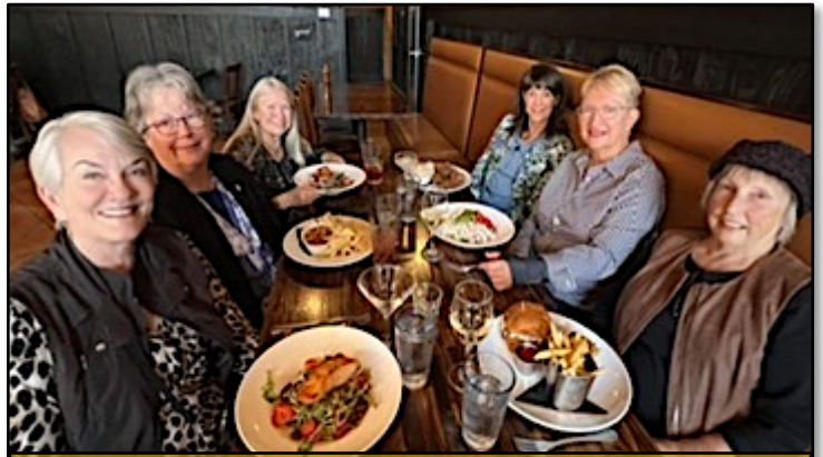
TGIF2 met at Rooster Creek in AG for a fun meal. (5/17/24)