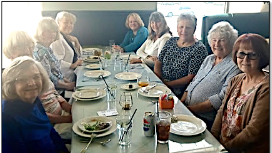
Lunch Bunch 1 enjoyed food & friendship at Thai Villa in Nipomo. (5/22/24)