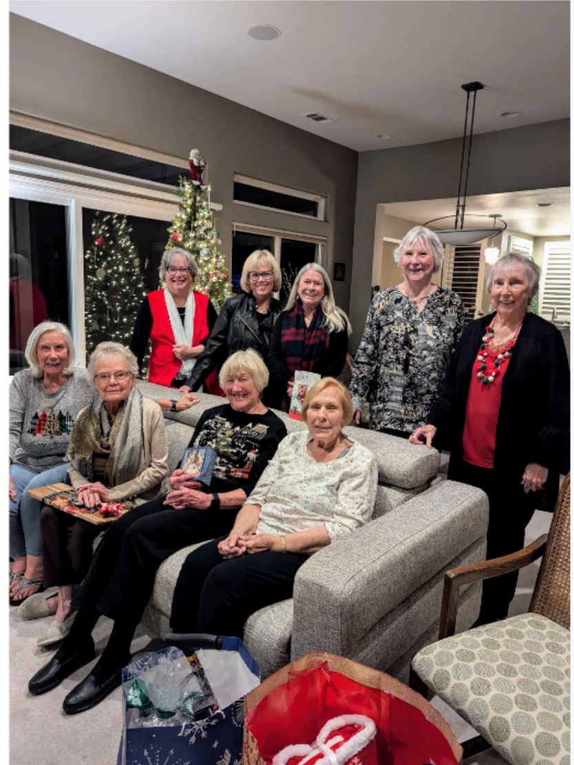
Bunco 2 Winners February 10th