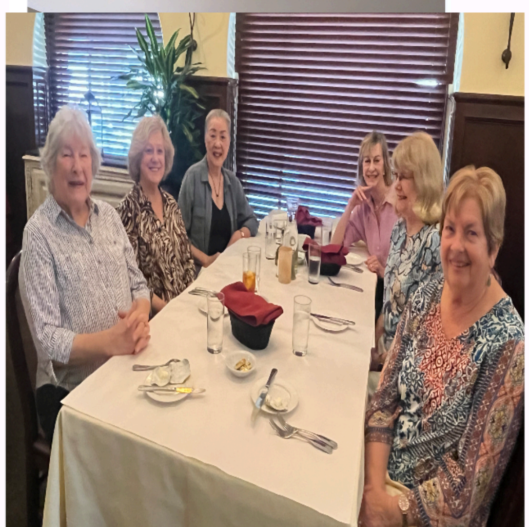
Lunch Bunch 1 at Rosa's Feb 26th