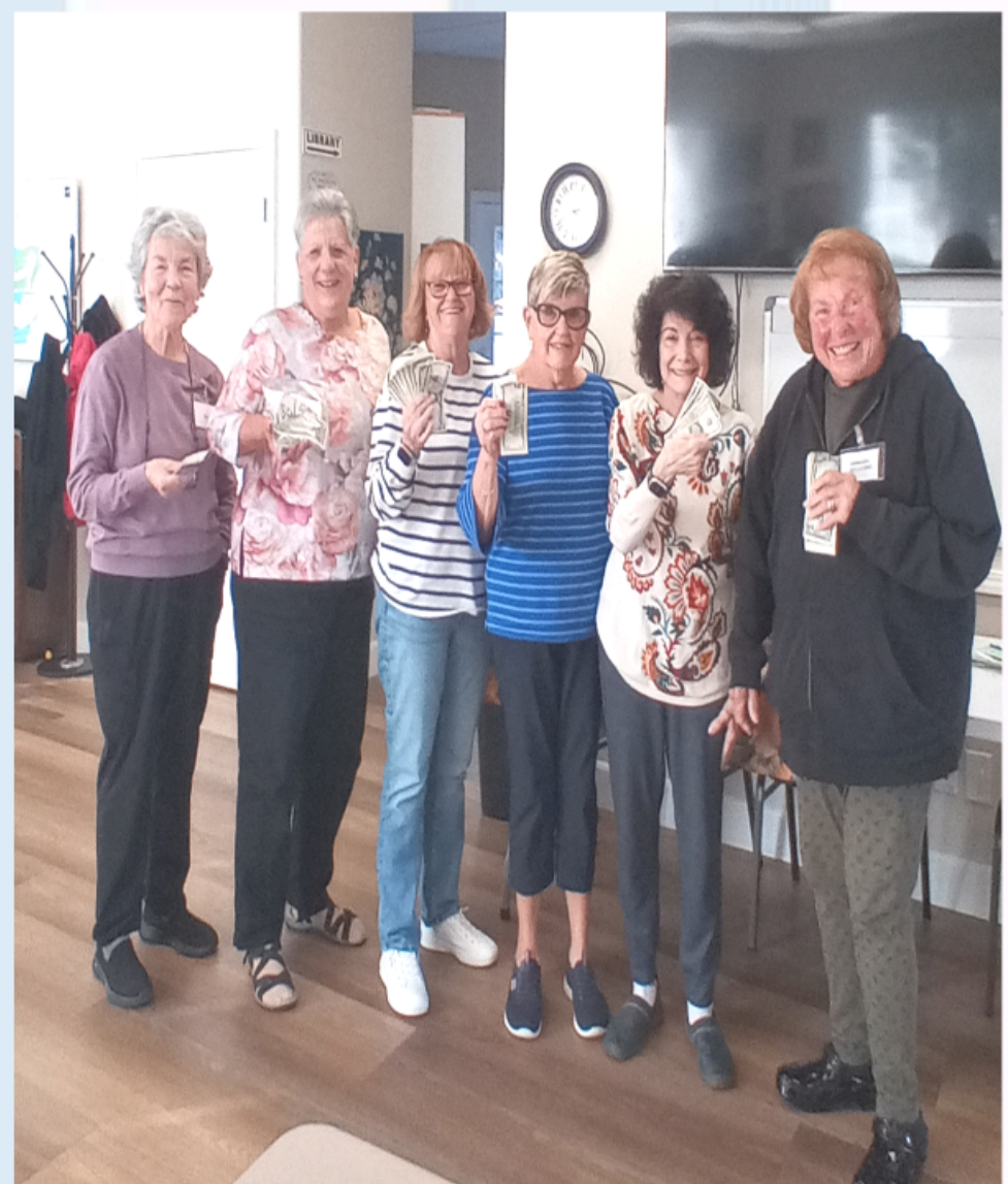
Bunco 1 Winners January 13