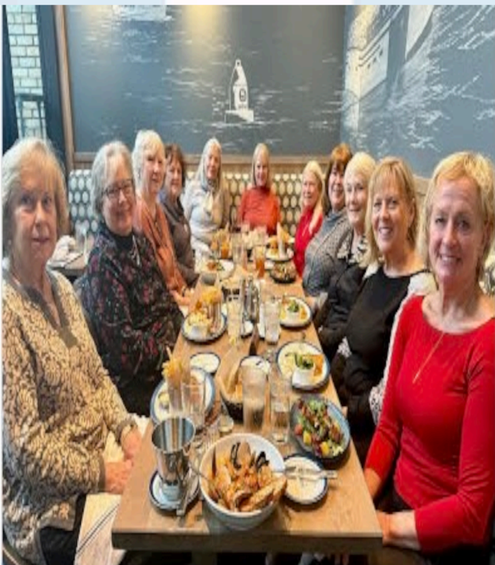
Lunch Bunch 2 at LURE