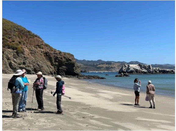
WOMEN'S HIKING GROUP enjoying the beach after a docent led hike on Pecho Coast Trail