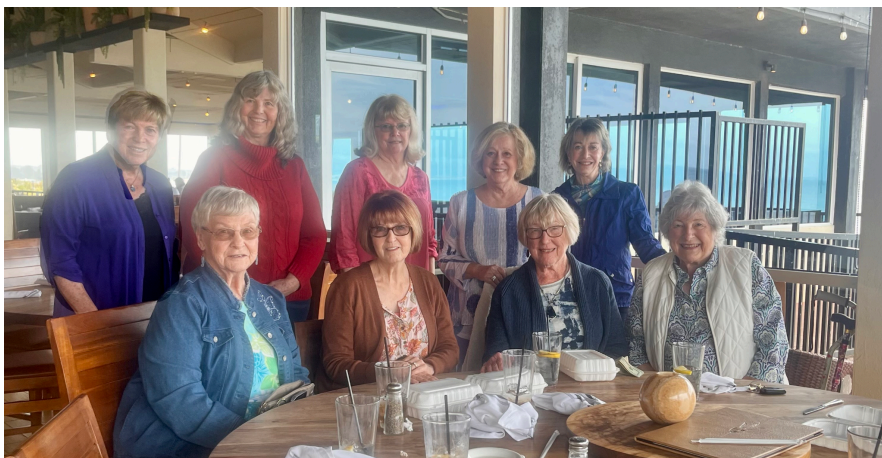
Lunch Bunch 1 at Ventana Grill